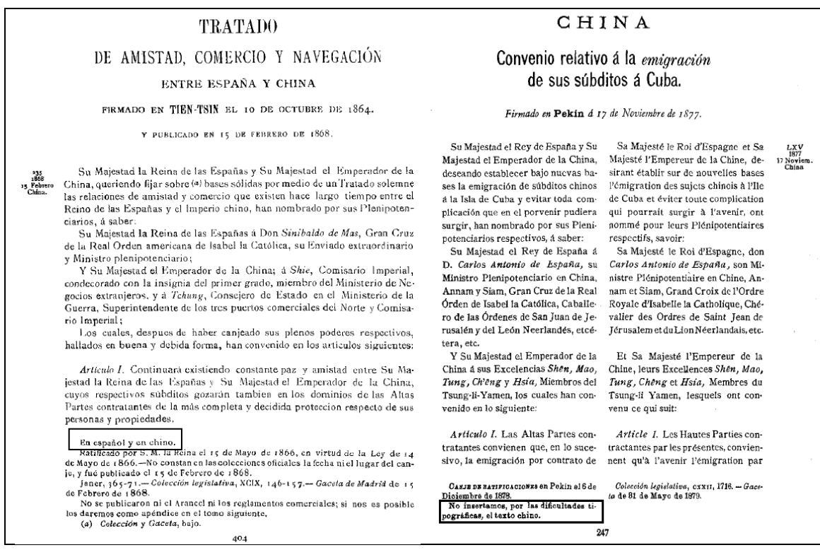
Figure 5: omitted translation samples with marking.